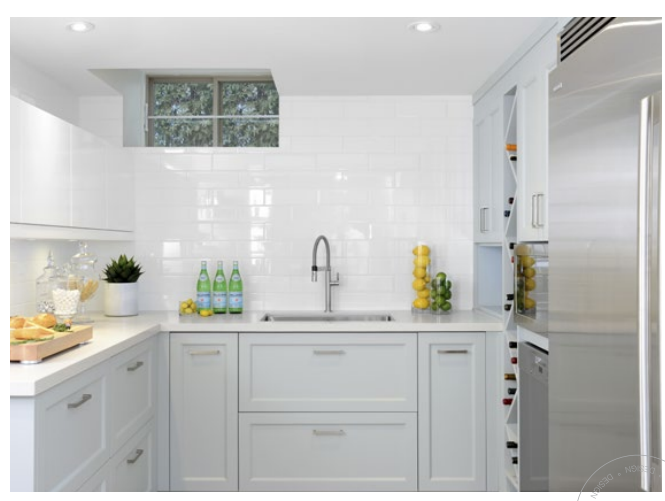
Caesarstone quartz tops the counter above the Shaker-style lower cabinets, while high-gloss cabinetry is mounted above. Faucet: Mini Culina by Blanco.

DESIGN movatohome.com DESIGN TORONTO SUMMER 2017 movatohome.com