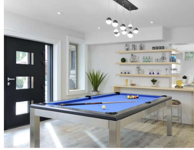
The pool table stands by the custom door that leads to the backyard, a space the homeowners often use for entertaining. Pendant light: Kuzco Lighting.